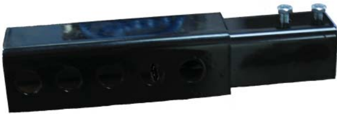
Figure 5-Assembly, Light Bar Extension

The 84-0101 would be purchased to use the light bar on the SC2100 Blue Ox sport carrier when they are locked in the up position.