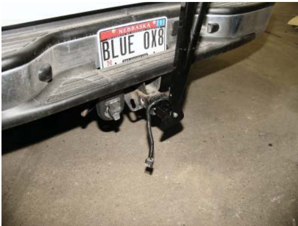
Figure 1-Inserting Light Bar Into Receiver

Attach the clip to the 5/8" pin. See Figure 3, below.