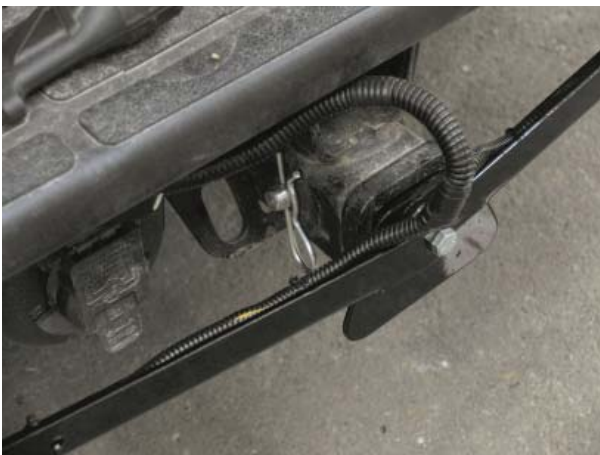
Figure 3-Inserting Receiver Pin Clip