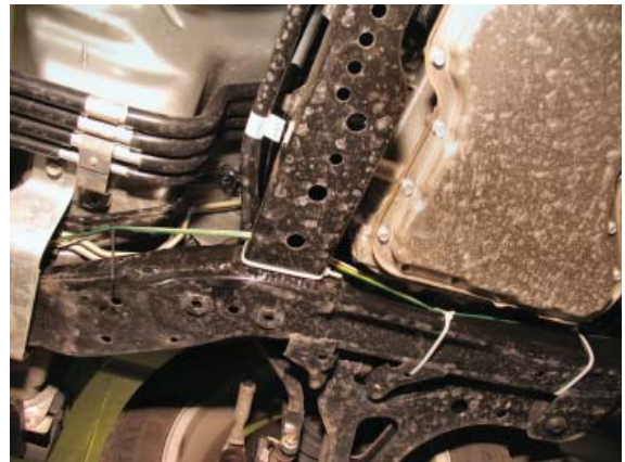
Figure 5-Routing/Securing Wire