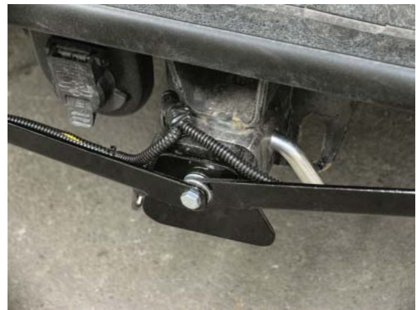
Figure 2-Inserting Receiver Pin