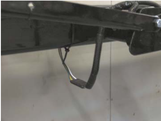
Figure 4-Attaching 4 Wire Plug

Wire the loose end of the 26 foot length wire into your 4 or 6 pin connector. See Sketch 1, below.