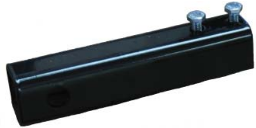
Figure 6-Assembly, Light Bar, 1 1/4 Adapter