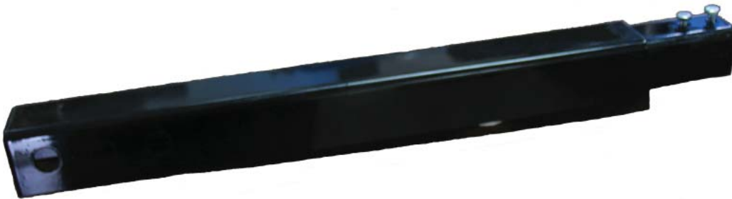
Figure 7-Assy, Light Bar, Carrier Adapter